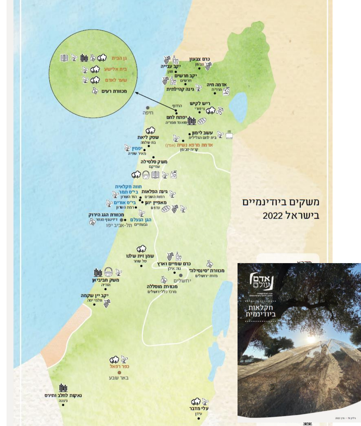
The Hebrew biodynamic Magazine 2022